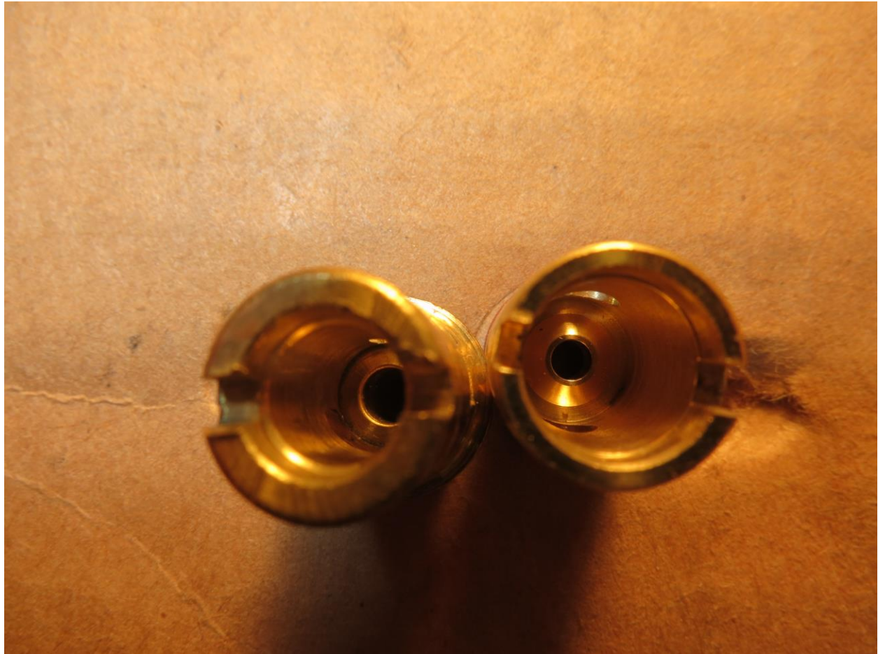
Pic 3 Left to right: Original Needle Valve opening compared to the Daytona Valve opening