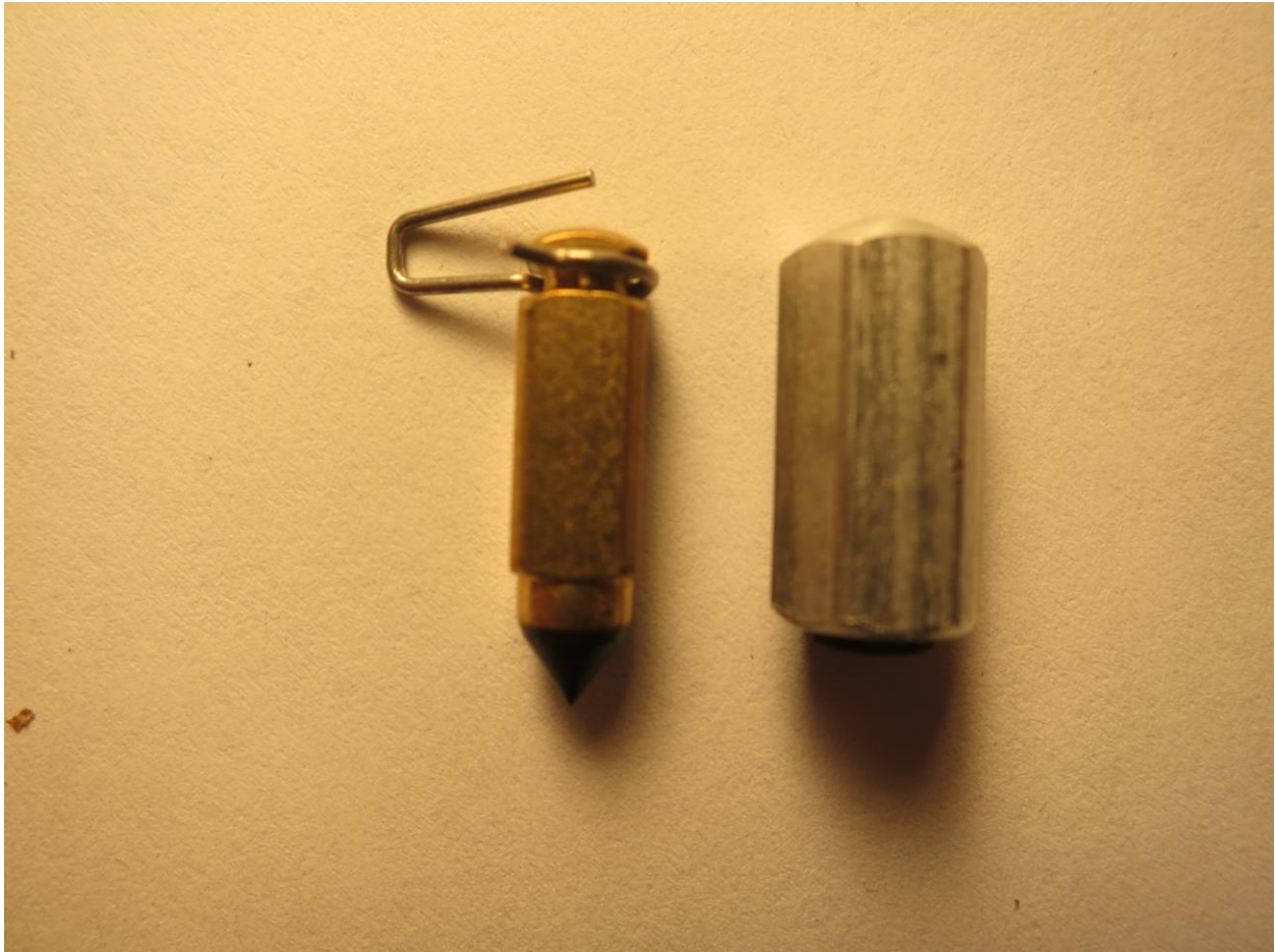
Pic 4 Left to right: Original Needle compared to the Daytona Valve